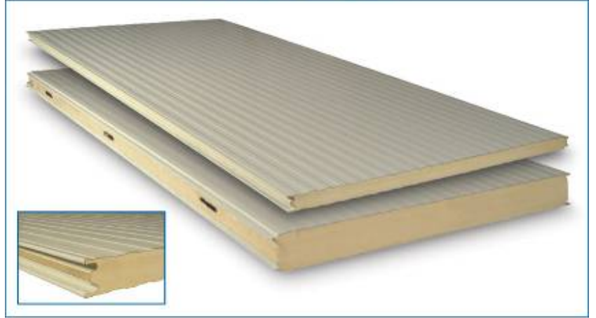
OLUKLU PANEL • RIBBET PANEL

Special accessories produced by the same surface material with the panels are used in panel corner joints.