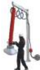
COMPLEMENTARY EQUIPMENT Manipulator for bags lifting