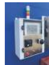
Simple and intuitive operator panel. Status of the system and instructions for the operator constantly displayed on the screen