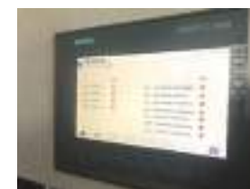
Touch panel for machine functions control