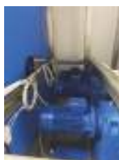
Fixed and independent motor groups