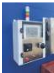
24/7 automatic distribution system with prepaid key