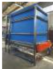
Rear view - transmission unit