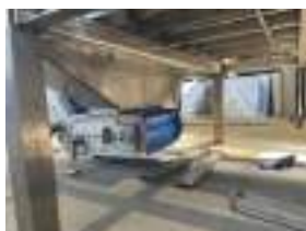
Conveyor belt for ice extraction