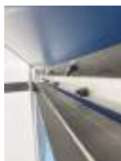
Carpentry made of AISI 034 stainless steel