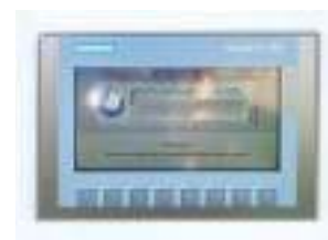
Easy check of the remaining credit on prepaid key