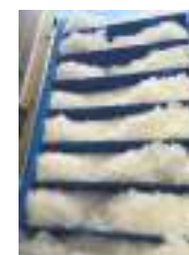
Ice transport on conveyor belt