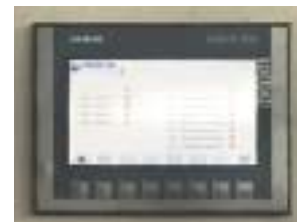
Siemens touch panel for the control and adjustment of all operating parameters