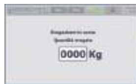
Instructions for the automatic ice distribution displayed on the panel