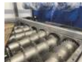
Variable pitch helical screw conveyors to avoid the compression of the ice