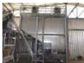
ICESILO version with stainless steel insulation