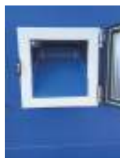
Ice exit chute