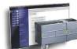
Siemens technology automation supporting INDUSTRY 4.0 technologies