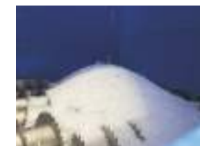
Inside view during ice production