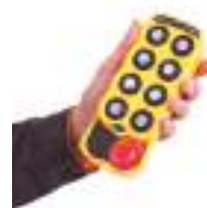
Screw conveyor operation: - button - remote control - external PLC - scale or dispenser impulse - magnetic card